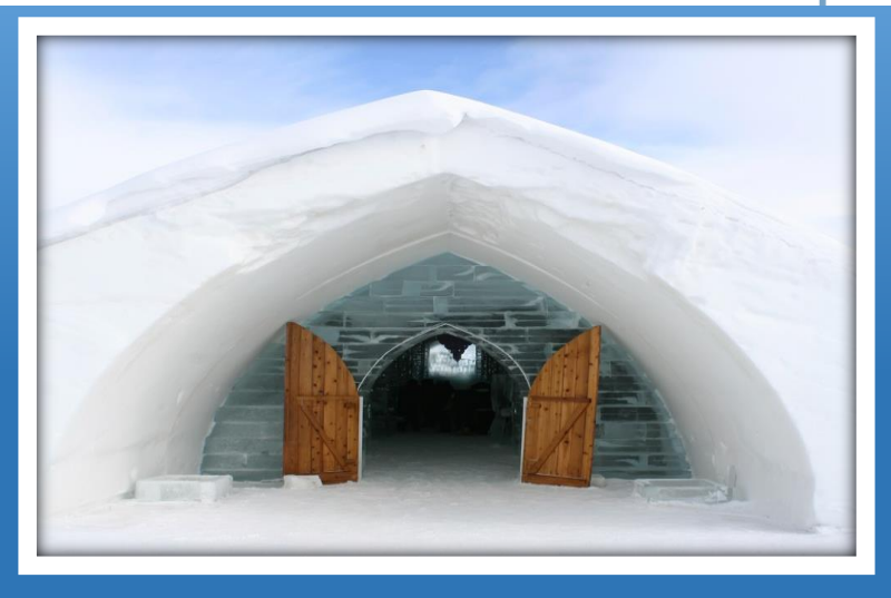
Behold, I stand at the door, and knock: if any man hear my voice, and open the door, I will come in to him, and will sup with him, and he with Me. – Revelation 3:20