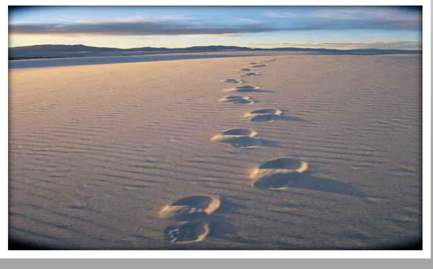
And He saith unto them, FOLLOW Me, and I will make you Fishers of Men. Matthew 4:19