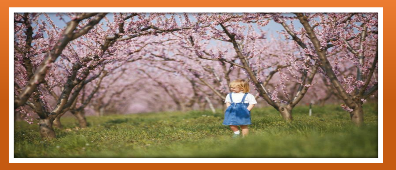
And said, Verily I say unto you, Except ye be converted, and become as little children,